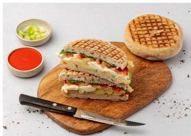
Joe & The Juice, Level 1, Crate & Barrel Wing