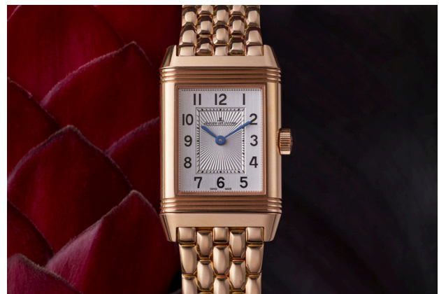
Jaeger-LeCoultre, Level 2, Carousel Court

Jaeger-LeCoultre unveils its new boutique, presenting an elegant setting for the Swiss Maison's legacy of fine watchmaking. Renowned for technical mastery and understated elegance, the house defines precision through design.